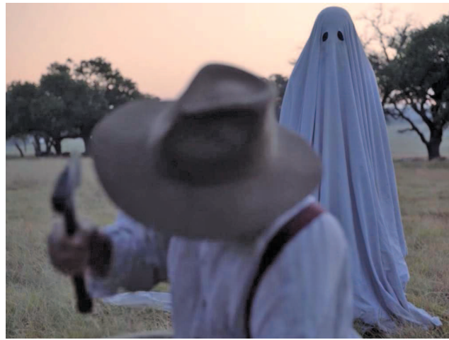
'A Ghost Story'

Thus unfolds "A Ghost Story," a pretentious speculation on loss from the perspective of the dearly departed. The tortoise-paced production