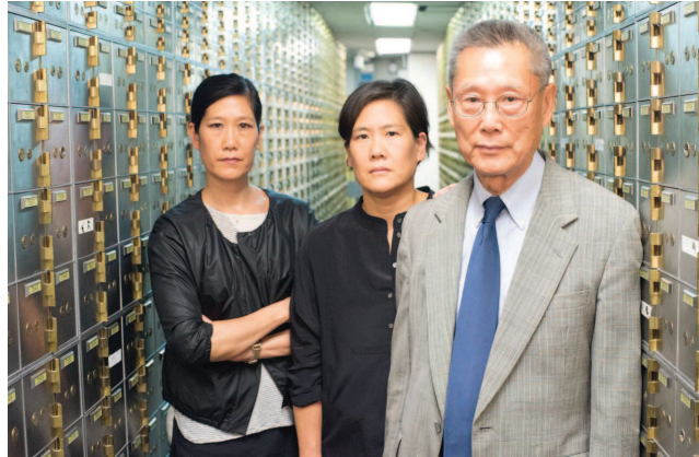
'Abacus: Small Enough to Jail'