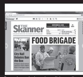
Page through the print edition online.