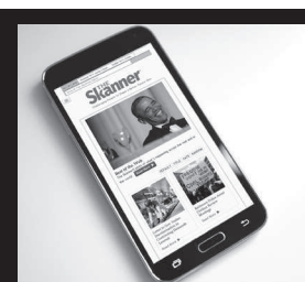
Grab a headline on your mobile device.