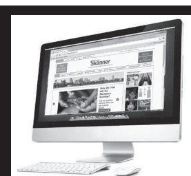
Enjoy an in-depth read on your desktop.