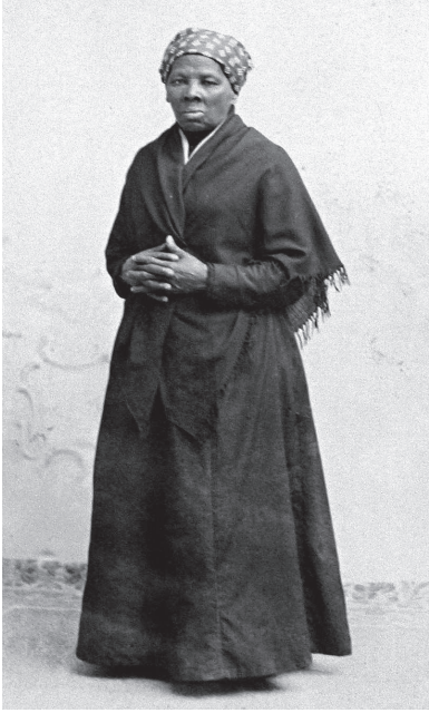
In April Treasury Secretary Jacob J. Lew proposed replacing the slaveholding Andrew Jackson on the $20 bill with Harriet Tubman, the former slave and abolitionist, and to add women and civil rights leaders to the $5 and $10 notes.

"For the Love of Money" honors barrier-breaking Black athletes, entertainers, civil rights leaders, military leaders and politicians and represents American and Black history milestones that have contributed to the betterment of the United States, from 18th century anti-slavery tokens through the latest Presidential bronze medals honoring Barack Obama.