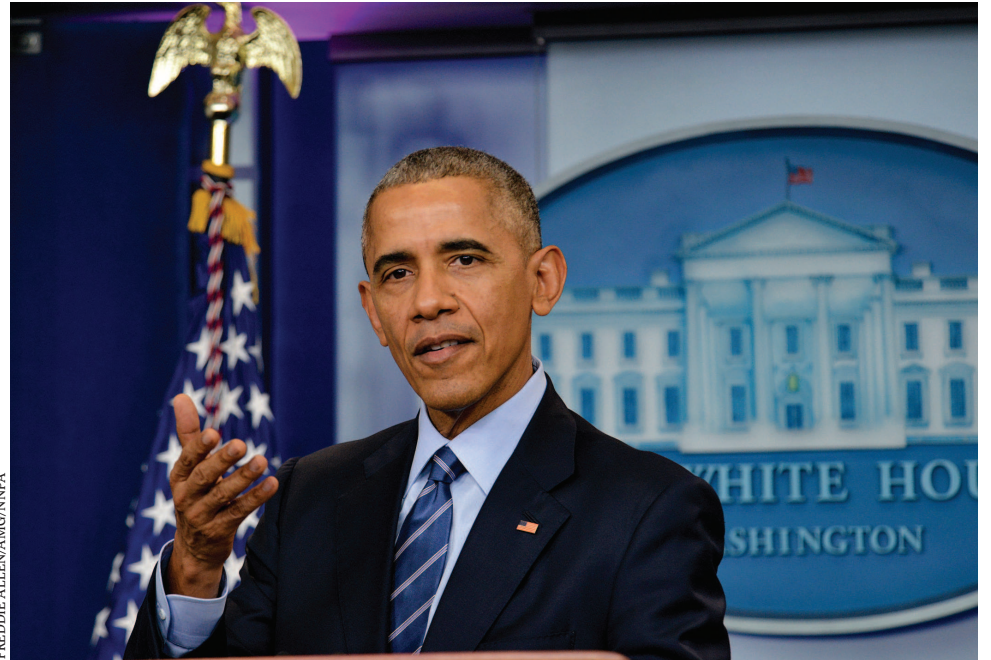
President Obama speaks during his last press conference of 2016.