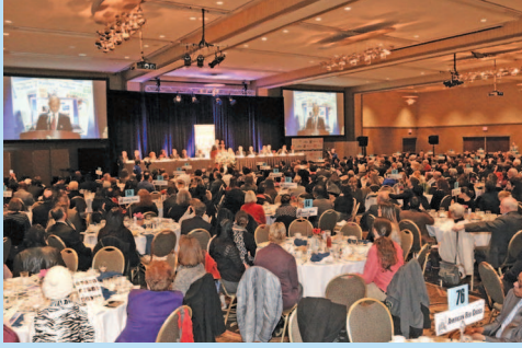
Martin Luther King, Jr. Breakfast 2016