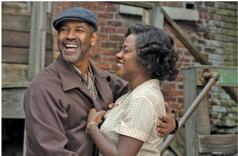
Denzel Washington and Viola Davis in 'Fences'

Neruda (R for profanity, sexuality and nudity) Chilean docudrama recounting the hunt in the late 1940s for Pablo Neruda (Luis Gnecco) following the Nobel Prize-winning poet-turned-fugitive's conversion to Communism. with Gael Garcia Bernal, Alfredo Castro and Mercedes Moran. (In Spanish and French