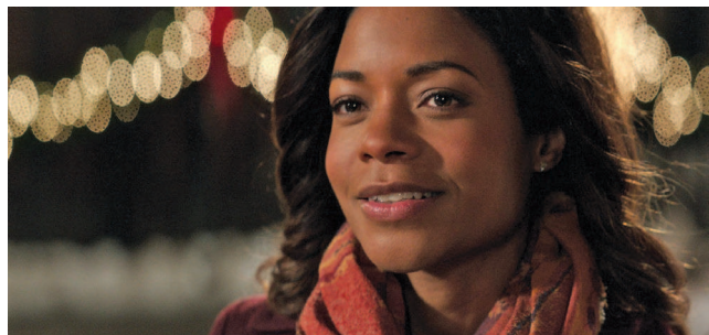
Naomie Harris in 'Collateral Beauty'