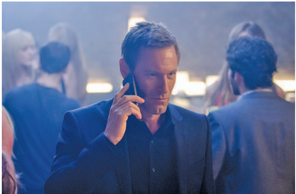
In 'Incarnate,' an unconventional exorcist (Aaron Eckhart) meets his match

A Girl like Grace (Unrated) Ryan Destiny portrays the title character in this coming-of-age drama as a grieving 17 year-old who is taken under the wing of her late BFF's (Paige Hurd) street-wise big sister (Meagan Good) after the friend commits suicide. Featuring Raven-Symone, Garcelle Beauvais