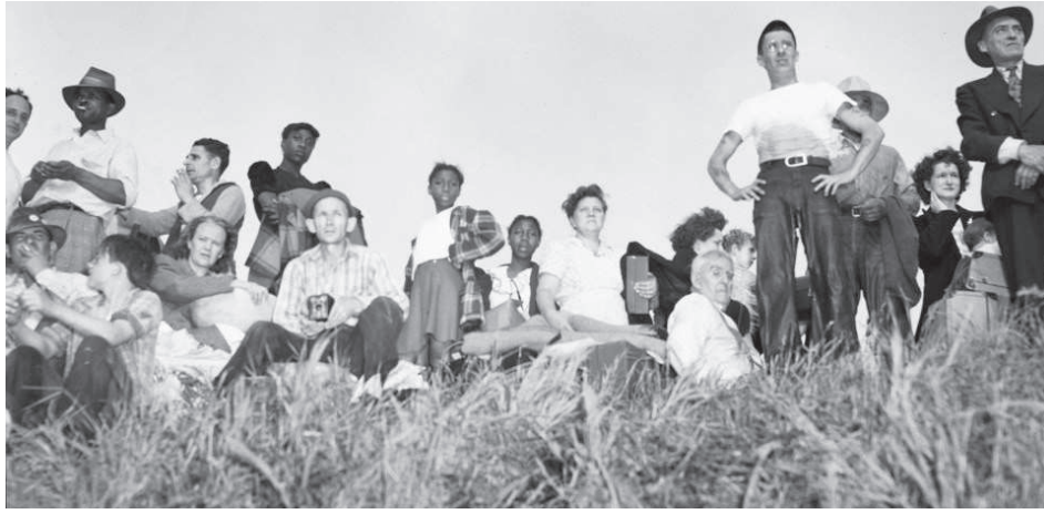
Survivors gather on high ground to watch the destruction of Vanport. May 30, 1948.