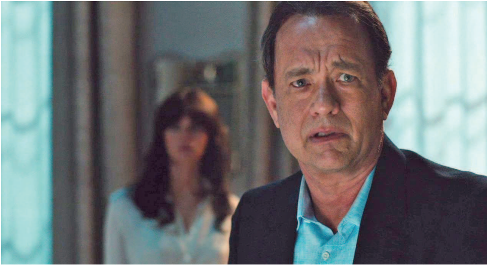
Tom Hanks returns as Robert Langdon in the third installment of The Da Vinci Code franchise, 'Inferno'