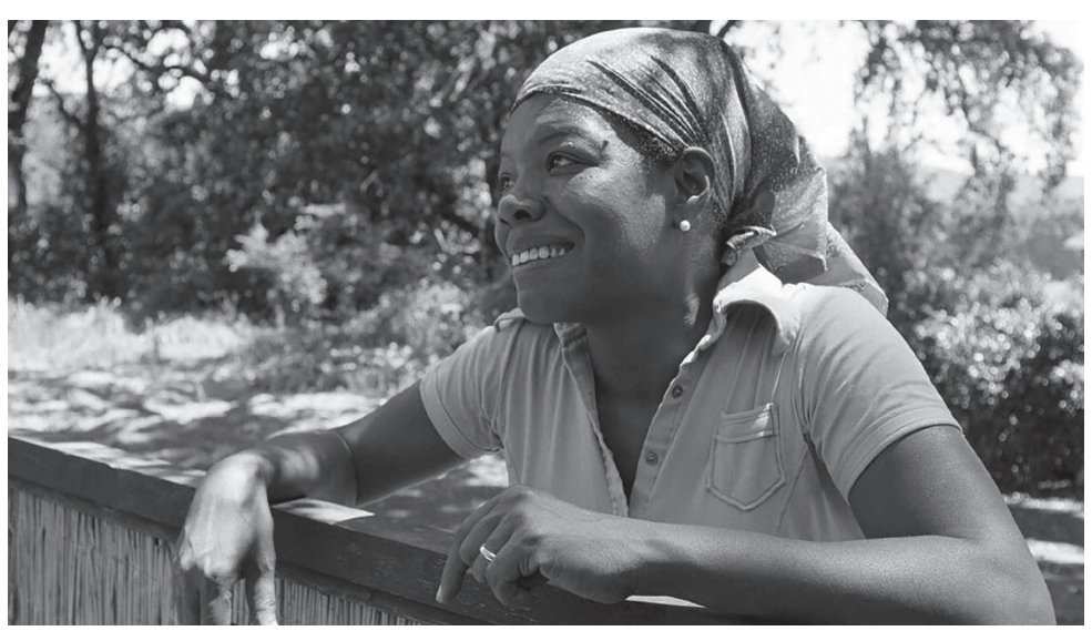
'Maya Angelou: And Still I Rise' is the first feature documentary to examine the life of the poet, writer and cultural icon.