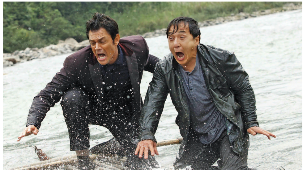
Johnny Knoxville co-stars with Jackie Chan in this stunt-driven comedy

Meanwhile, half a world away, Johnny just happens to wit-