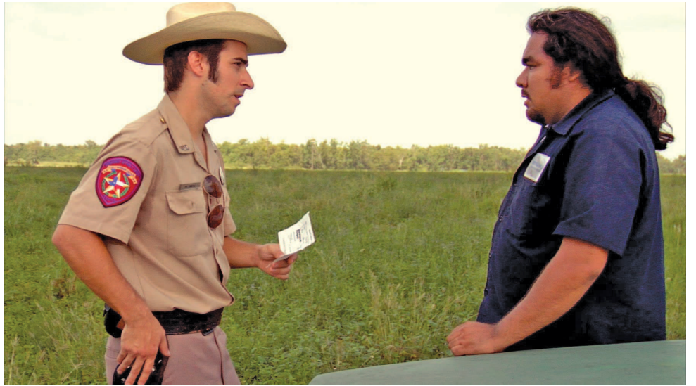
'In Search of the American Dream' is the story of six sibling's attempt to elude the authorities in a race across Texas after their undocumented parents are arrested and taken away.