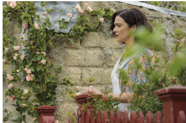
Set in Australia post WWI, 'The Light Between Oceans' is a romance drama about a lighthouse keeper (Michael Fassbender) and his wife (Alicia Vikander) who decide to adopt a baby.

New York City saga about a hedonistic college coed (Morgan Saylor) whose life spirals out of control after she falls head-over-heels for a bad boy (Brian 'Sene' Marc) dealing dime bags on her block. Cast includes Chris Noth, Justin Bartha and Adrian Martinez.