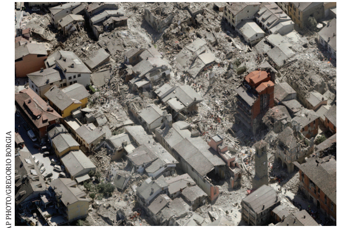
Aerial view of Amatrice in central Italy, Wednesday, Aug. 24, 2016, as it appears after a magnitude 6 quake struck at 3:36 a.m. (0136 GMT) and was felt across a broad swath of central Italy, including Rome where residents of the capital felt a long swaying followed by aftershocks.

Dozens of people were pulled out alive by rescue teams and volunteers that poured in from around Italy.