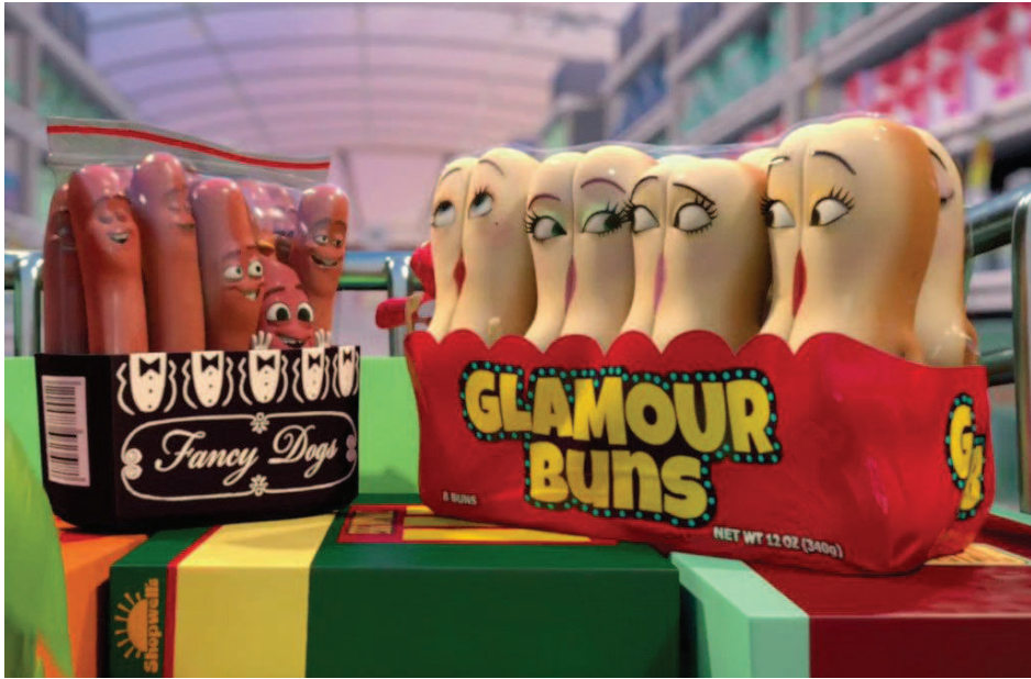
Seth Rogen voices the character Frank who has a crush on a Glamour Bun, voiced by Kristen Wiig.