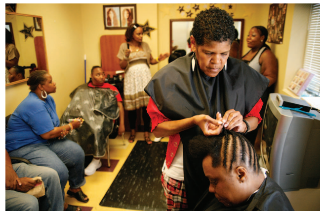
'Hollywood Beauty Salon'

What makes this hairdresser different is that its patrons and staff members are all in recovery from mental illness and/or dependence on drugs or alcohol. Shot over the course of four years, the movie chronicles the camaraderie among the cosmetologists and clientele, while simultaneously telescoping on the touching life stories of seven of the