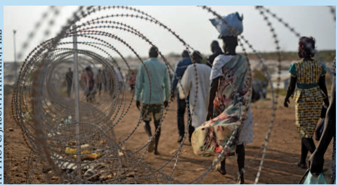
In this file photo taken Tuesday, Jan. 19, 2016, displaced people walk next to a razor wire fence at the United Nations base in the capital Juba, South Sudan. South Sudanese government soldiers raped dozens of ethnic Nuer women and girls last week just outside a United Nations camp, and at least two died from their injuries, witnesses and civilian leaders said.