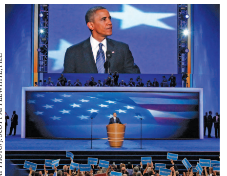
In this Sept. 6, 2012 file photo, President Barack Obama speaks at the Democratic National Convention in Charlotte, N.C. The president acknowledged Wednesday, July 27, 2016, that his hopes for a new tone in politics, embodied in the rousing Democratic convention speech he delivered 12 years ago, never materialized. Still, he says he remains undaunted.