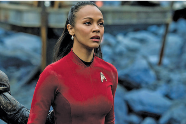
Zoe Saldana plays Lt. Uhuru in 'Star Trek Beyond'

saber-toothed squirrel Scrat's (Chris Wedge) pursuit of that ever-elusive acorn. Voice cast ensemble includes Queen Latifah, Jennifer Lopez, Simon Pegg, Michael