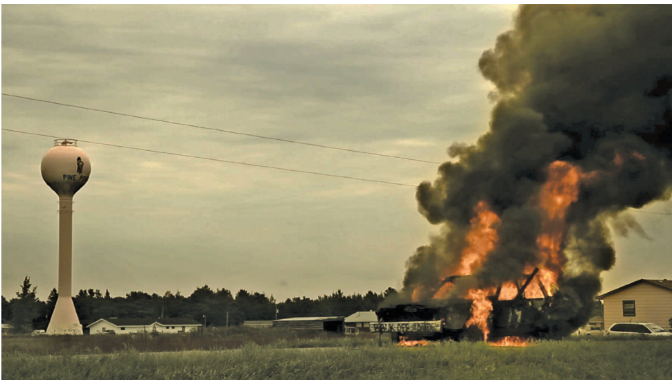
The Seventh Fire' is Native American documentary about a jailed gang leader just sentenced to prison who rethinks his violent lifestyle.

Absolutely Fabulous (R for profanity, sexuality and drug use) Adaptation of the British TV sitcom revolving around a couple of flamboyant, aging fashionistas (Jennifer Saunders and Jo-