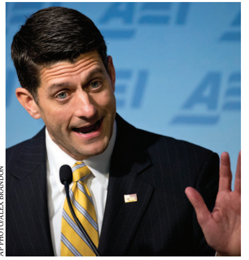
House Speaker Paul Ryan of Wis. speaks at the American Enterprise Institute (AEI) in Washington, Wednesday, June 22, 2016, on new proposals to repeal and replace President Barack Obama's health care law.

on individual tax credits to allow people to buy coverage from private insurers, and includes other largely familiar GOP ideas such as medical liability reform and expanding access to health savings accounts. It proposes putting $25 billion behind high-risk pools for people with pre-existing conditions and for others, and transforming the federal-state Medicaid program for the poor by turning it into state block grants or individual per-capita allotments to hold down spending.