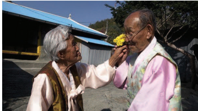
'My Love, Don't Cross That River'