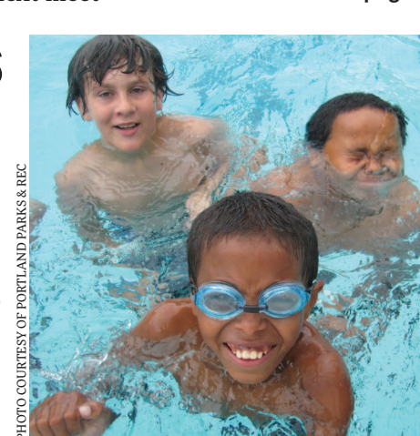
Portland Parks & Recreation will provide a wide variety of free and low-cost programs for children and teens this summer, including free movies, summer meals and daily play programs.