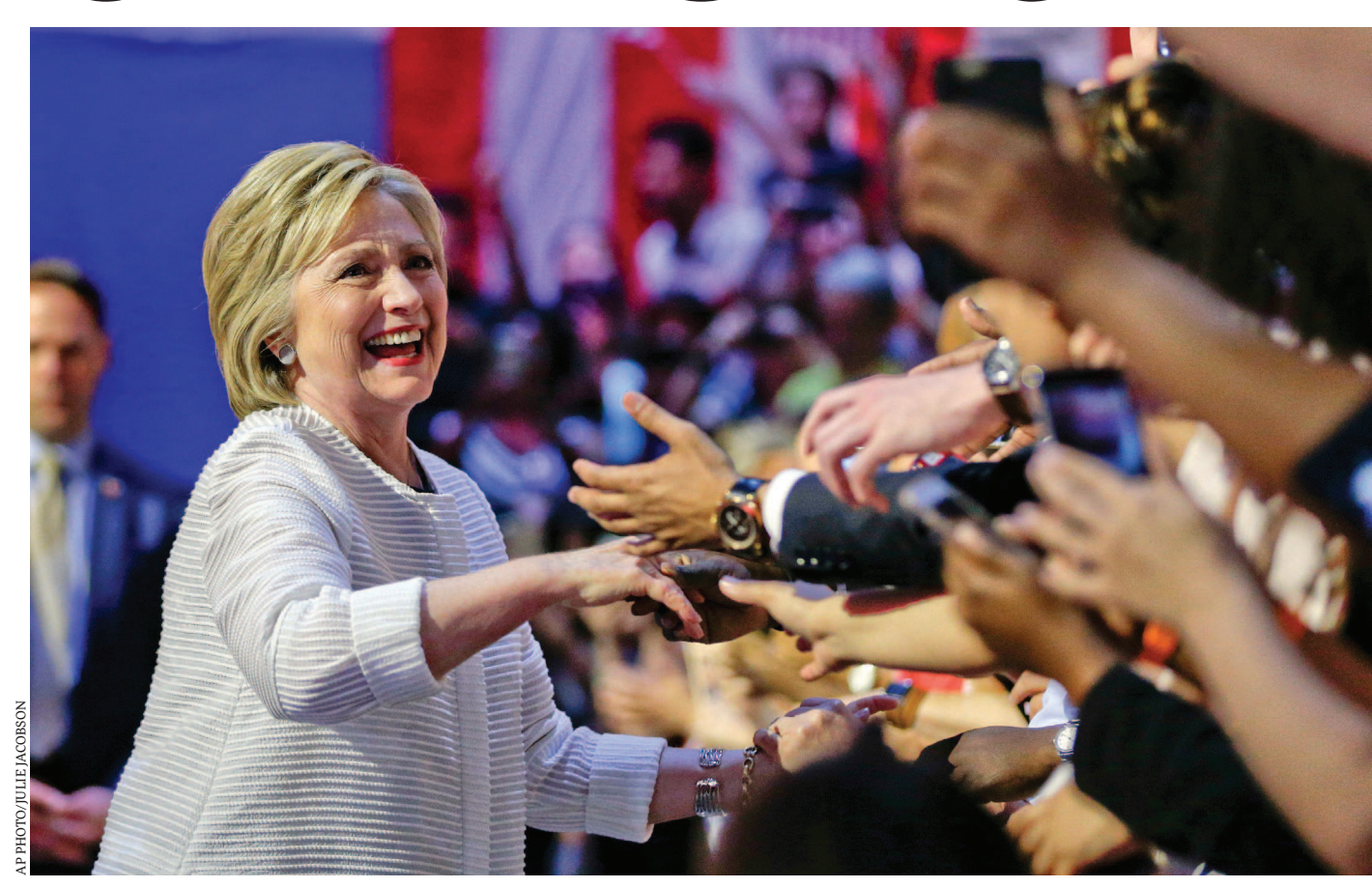
Democratic presidential candidate Hillary Clinton greets supporters as she arrives to speak during a presidential primary election night rally Tuesday in New York. Hillary Clinton declared victory in her yearlong battle for the heart of the Democratic party, seizing her place in history as the first female candidate of a major party and setting out on the difficult task of fusing a fractured party to confront Donald Trump. Clinton cruised to easy victories in three of the six state contests on Tuesday – including delegate-rich New Jersey. She had already secured the delegates needed for the nomination before Tuesday's contests, according to an Associated Press tally. Still, Sanders had hoped to use a victory in California to persuade party insiders to switch their allegiances.