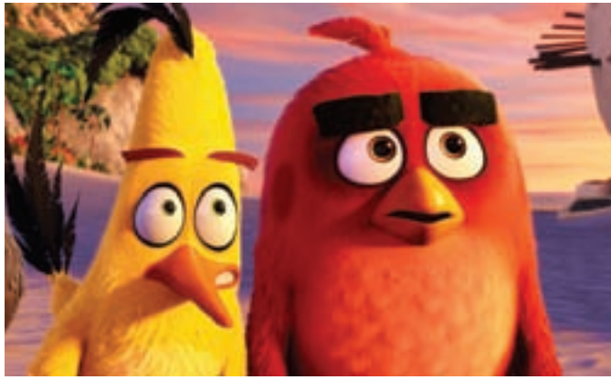
Josh Gad is the voice of Chuck and Jason Sudeikis of Red in this "frenetically-paced production" based on the free-to-play game

The plot thickens upon the arrival of a big boat containing a couple of green pigs (Bill Hader and Tony Hale) claiming to be alone and explorers coming