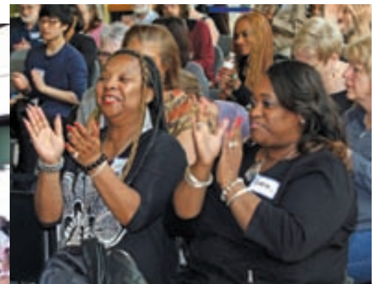
Audience members clap at the conclusion of the film.