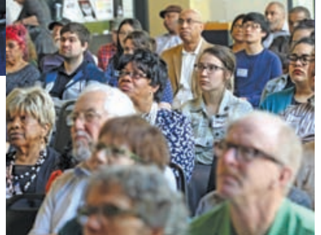
The film, The Wake of Vanport , played to a full house at the Oregon Historical Society on April 3, 2016.