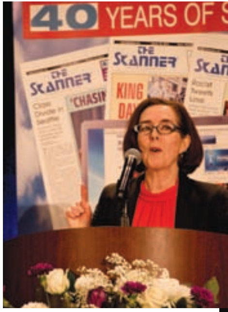
Governor Kate Brown