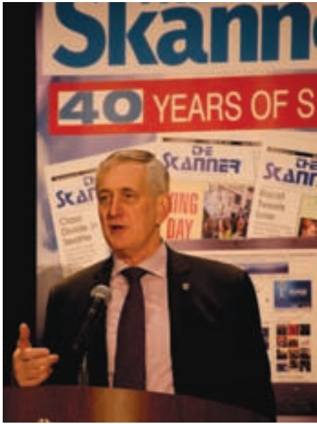
Mayor Charlie Hales