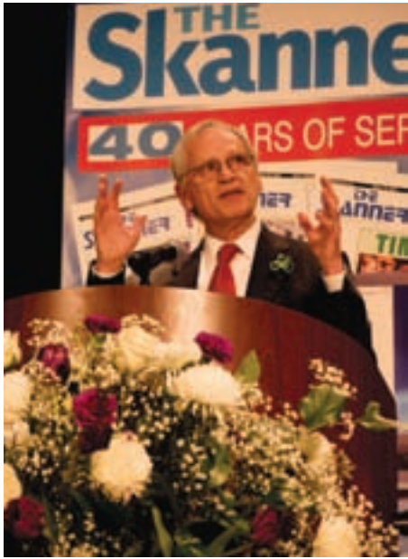
US Representative Earl Blumenauer