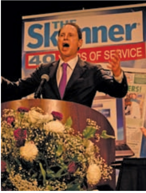
US Senator Ron Wyden