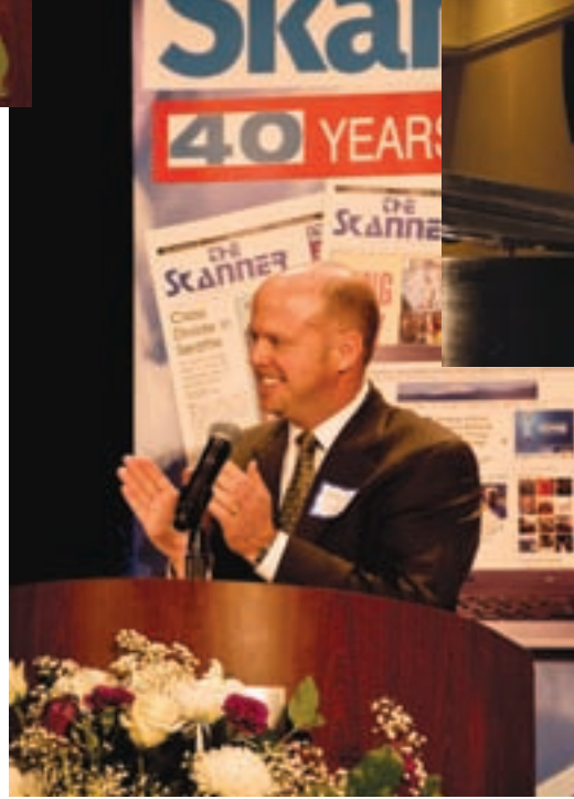
State Senator Chip Shields