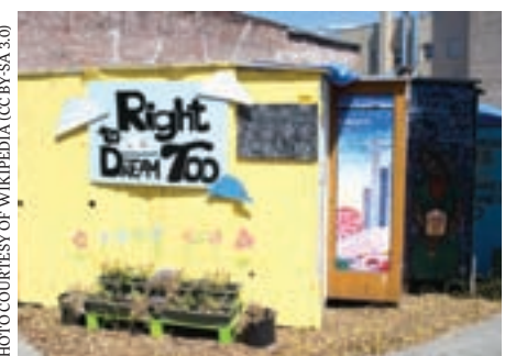
Right 2 Dream Too is one of the scheduled stops on the route of a planned protest march this Friday. The organization that supports the camp, along with other community groups including Don't Shoot Portland, VOZ and the Portland Tenants Union, are planning a day of protests relating to racial, economic and housing justice.