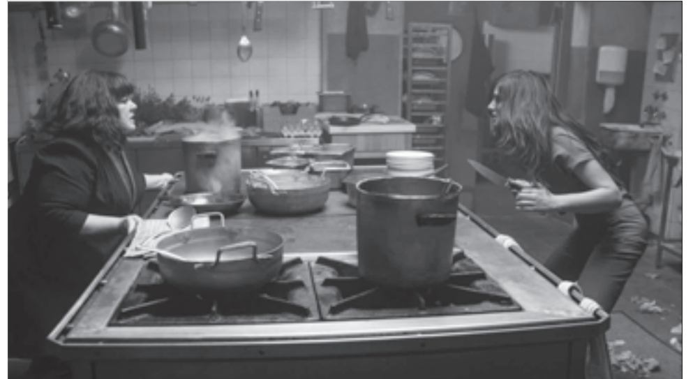
A kitchen fight erupts in the movie 'Spy' with McCarthy and Nargis Fakhri

Melissa McCarthy Stars as CIA Analyst-Turned-Spy in Fish-Out-of-Water Comedy