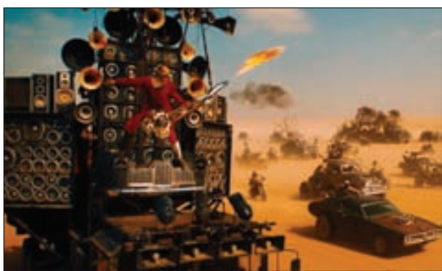
Mad Max: Fury Road

Mad Max: Fury Road (R for disturbing images and pervasive intense violence) Tom Hardy plays the title character in this reboot of the apocalyptic sci-fi franchise as a warrior haunted by his turbulent past who joins forces with a group fleeing across the barren desert to escape a despicable tyrant (Hugh Keays-Byrne). Co-starring Charlize Theron, Zoe Kravitz, Adelaide Clemens