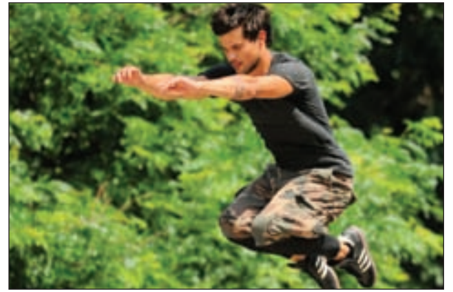
Taylor Lautner in 'Tracers'

Kumiko, the Treasure Hunter (Unrated) Rinko Kikuchi handles the title role in this character-driven drama inspired by the urban legend about a cash-strapped woman who migrates from Japan to the