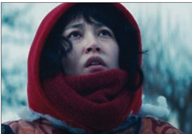
Kumiko, 'The Treasure Hunter'