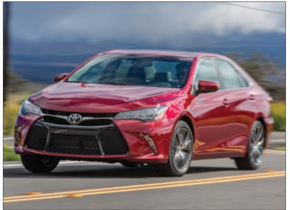
2015 Toyota Camry

There are five versions of the 2015 Toyota Camry including the hybrid. The LE with a four-cylinder