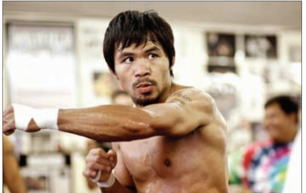
Jericho Rosales as the title role in Manny

profanity, sexuality and brief violence) Oscar-winner Barry Levinson (for Rain Man ) directed this adaptation of the Philip Roth best-seller of the same name about an aging actor (Al Pacino) whose life is turned upside-down when he embarks on an ill-advised affair with a considerably-younger lesbian (Greta Gerwig). Support cast includes Dianne Wiest, Charles Grodin, Mandy Patinkin and Kyra Sedgwick.