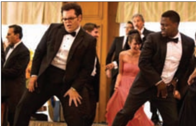
The Wedding Ringer

ing to cripple the international banking network. With Viola Davis, Wei Tang, John Ortiz and William Mapother. (In English and Spanish with subtitles)