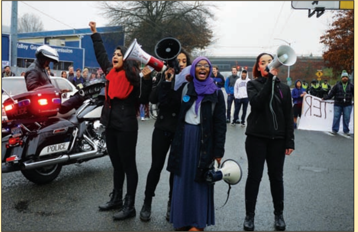
Members of Women of Color for Systemic Change lead a crowd occupying an intersection on Rainier Avenue in a chant during a Black Lives Matter Protest for Police Accountability on Jan. 10. A group of several hundred people marched from Martin Luther King Jr. Memorial Park to the King County Youth Detention Center.