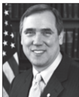
Sen. Jeff Merkley