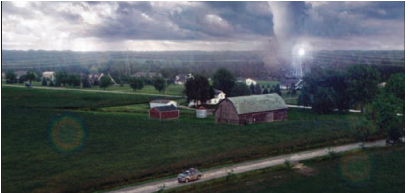
Into The Storm

Teenage Mutant Ninja Turtles (PG-13 for violence) Reboot of the adaptation of the comic book franchise finds the