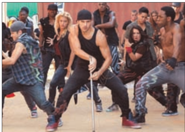
Step Up All In