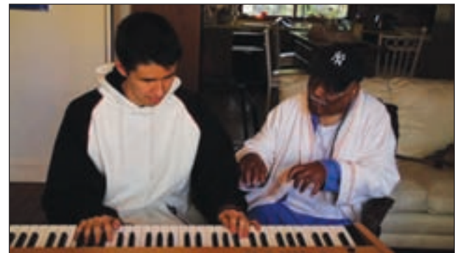
Keep On Keepin' On

anthropomorphic protagonists (Alan Ritchson, Noel Fisher, Jeremy Howard and Pete Ploszek) rising from NYC's sewers to fight their archenemy (William Fichtner) and his army of ninjas, with the help of an intrepid, young reporter (Megan