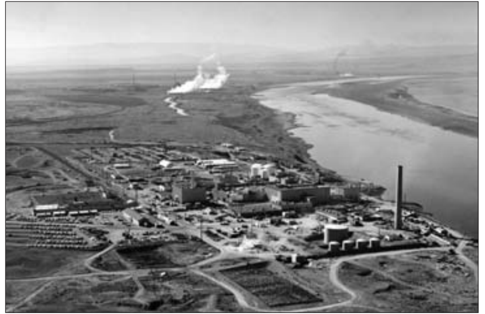
Hanford's twin KE and KW nuclear reactors in 2008 with the B Reactor in the distance

in the 1940s as part of the top-secret Manhattan Project to build the atomic bomb. Today, it is the nation's most contaminated nuclear site, with cleanup expected to last decades.