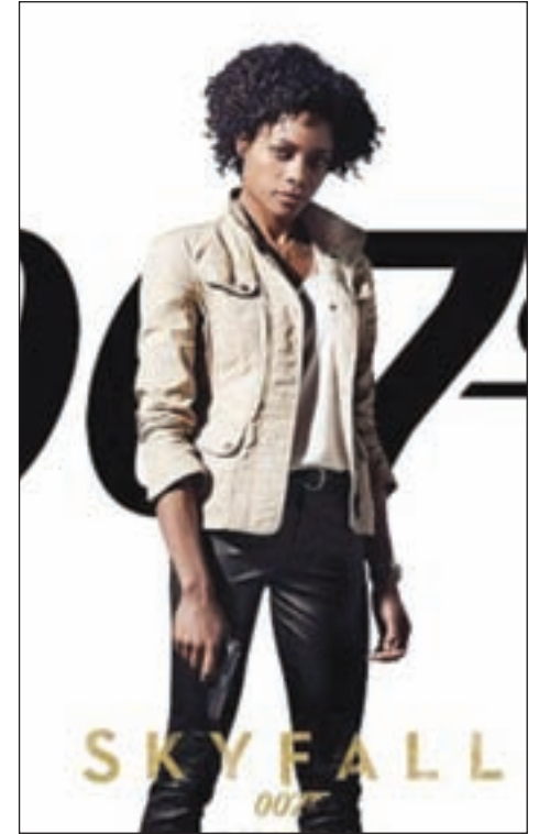
Naomie Harris starred in the James Bond 007 movie "Skyfall"