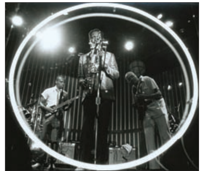
'Ornette: Made in America'

For a Good Time, Call (R for profanity, drug use and graphic sexuality) Raunchy romantic romp revolving around a couple of cash-strapped roommates (Ari Graynor and Lauren Miller) who resort to phone sex to pay the rent on their pricey Manhattan apartment. Ensemble cast includes Seth Rogen, Mimi Rogers, Nia Vardalos.