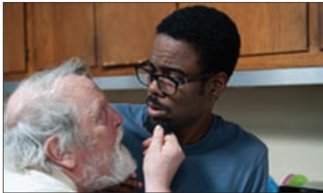
'2 Days in New York'

The Campaign (R for profanity) Election year comedy chronicling a cut-throat political campaign pitting a disgraced, North Carolina Congressman (Will Ferrell) against a naïve contender (Zach Galifianakis) whose dirty tricks are being financed by a couple of wealthy business-