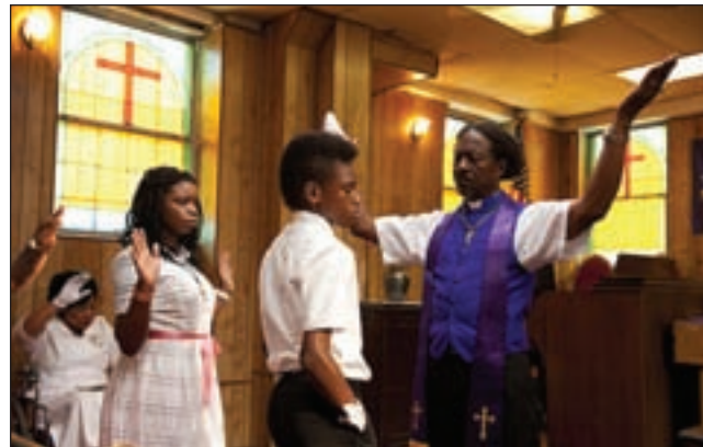
'Red Hook Summer'