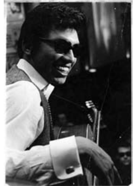
'Searching for Sugar Man'

Sacrifice (Unrated) Screen adaptation of the play "The Orphan of Zhao," a historical drama, set in ancient China, about the sole sur-