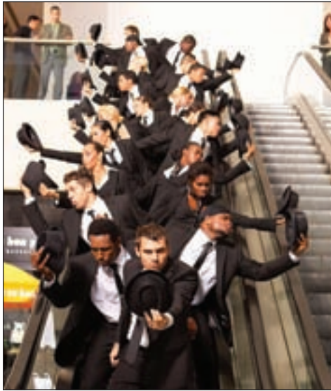
'Step Up Revolution'