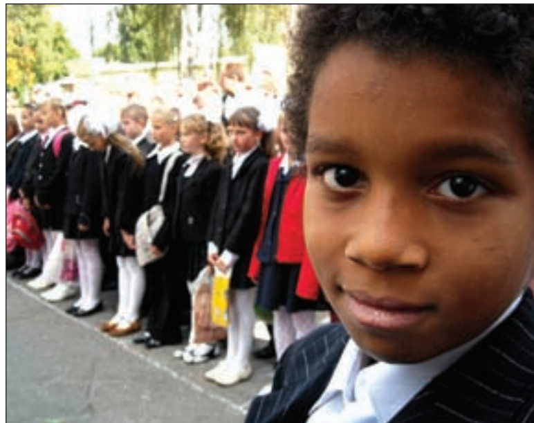
'Family Portrait in Black and White'

Gei Oni (Unrated) Middle East drama interweaving a novel love story with a depiction of the first wave of Jewish European migration to the Ottoman-ruled Palestine of the 1880s. Starring Tamar