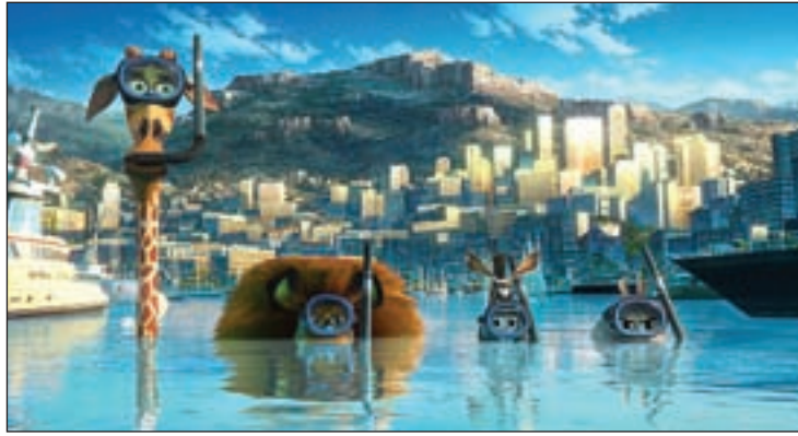
'Madagascar 3: Europe's Most Wanted'

Corpo Celeste (Unrated) Coming-of-age drama about a 13 year-old (Yle Vianello) who resists the pressure to practice Catholicism when her family