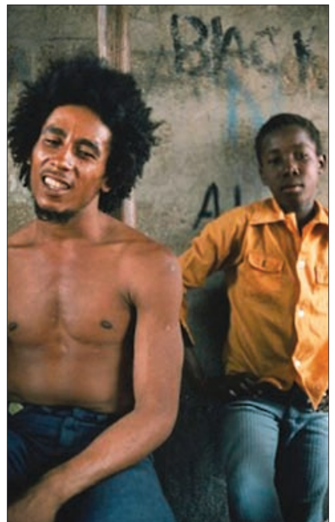
Bob Marley and his son Ziggy

ZM: I hope that the distributors will make the movie available in whatever subti-