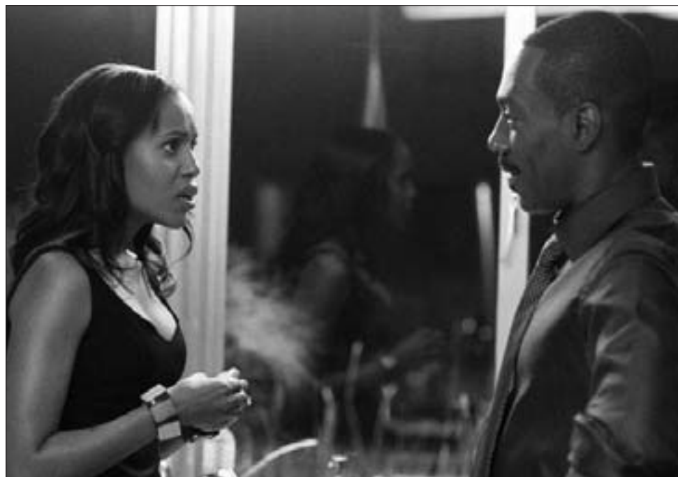
Kerry Washington and Eddie Murphy star in 'A Thousand Words'