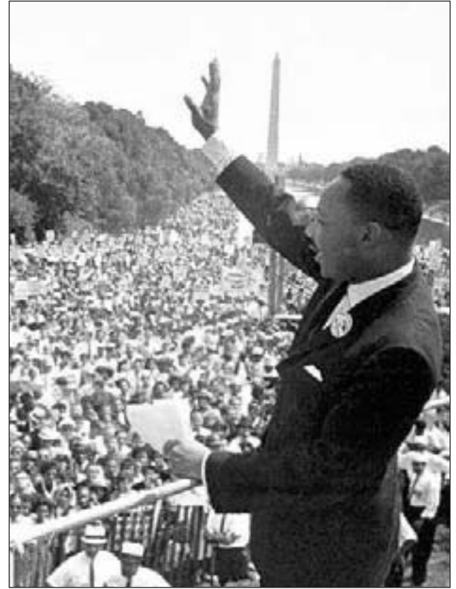
The March on Washington