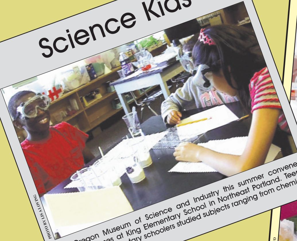
The Oregon Museum of Science and Industry this summer convened science classes at King Elementary School in Northeast Portland. Teens, tweens and elementary schoolers studied subjects ranging from chemistry to forensic science.