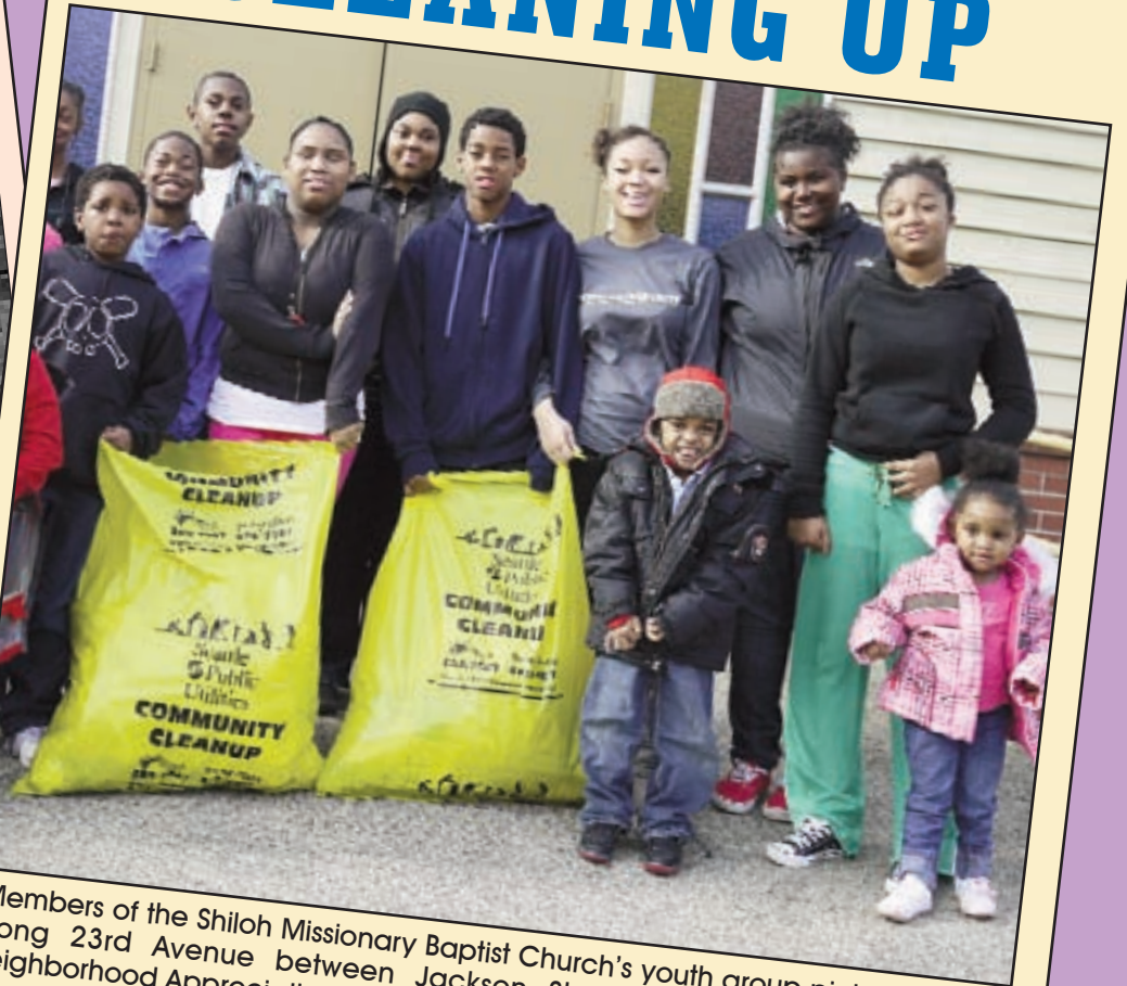
Members of the Shiloh Missionary Baptist Church's youth group picked up trash along 23rd Avenue between Jackson Street and Rainier on Feb. 12, Neighborhood Appreciation Day. The church has adopted the street in effort to keep the area clean.