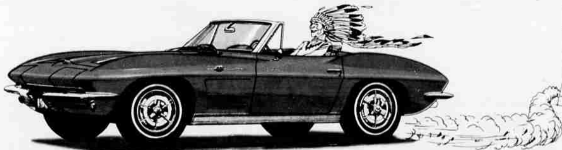
CORVETTE STING RAY CONVERTIBLE

packing; the rear-engine Corvair , a sports car by instinct and a family car by choice; and for pure driving adventure, two all-new versions of America's only home-grown sports car, Corvette . Take your pick. If driving any one of them at your Chevrolet dealer's doesn't have you poring over road maps, you'd probably rather spend your vacation just showing it off around town!