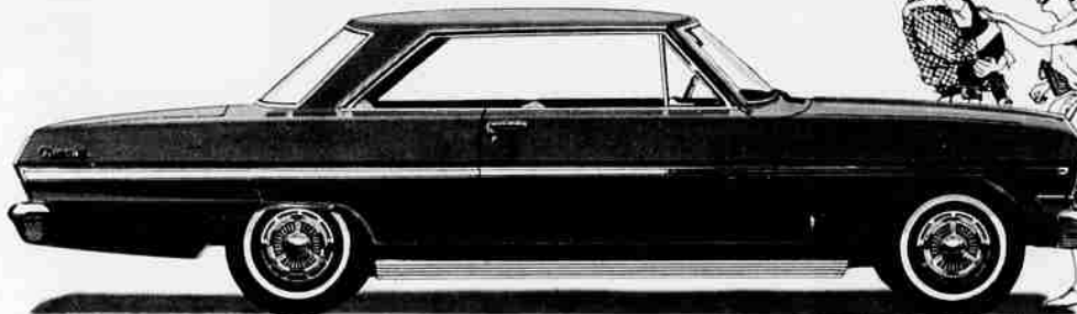
CHEVY II NOVA 400 SPORT COUPE