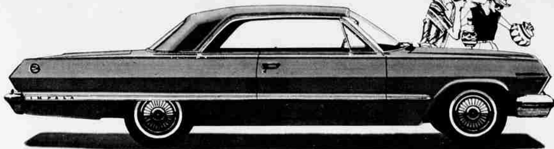
CHEVROLET IMPALA SPORT COUPE