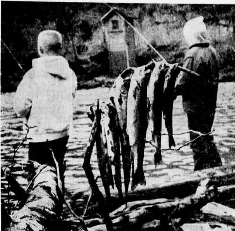
Blue River Yielded Several Limit Catches

On the middle fork of the Willamette, bank anglers at the upper end of Hills Creek reservoir piled up good catches with many of the rainbows ranging from 12 to 18 inches. Fishermen there fared better than those who trolled spinners and worms. Action also was slower in the river above the reservoir.