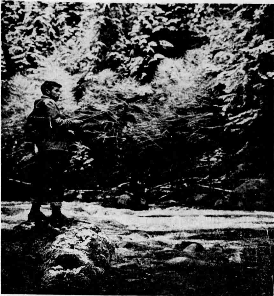
Snow on South Fork of McKenzie Didn't Discourage Him