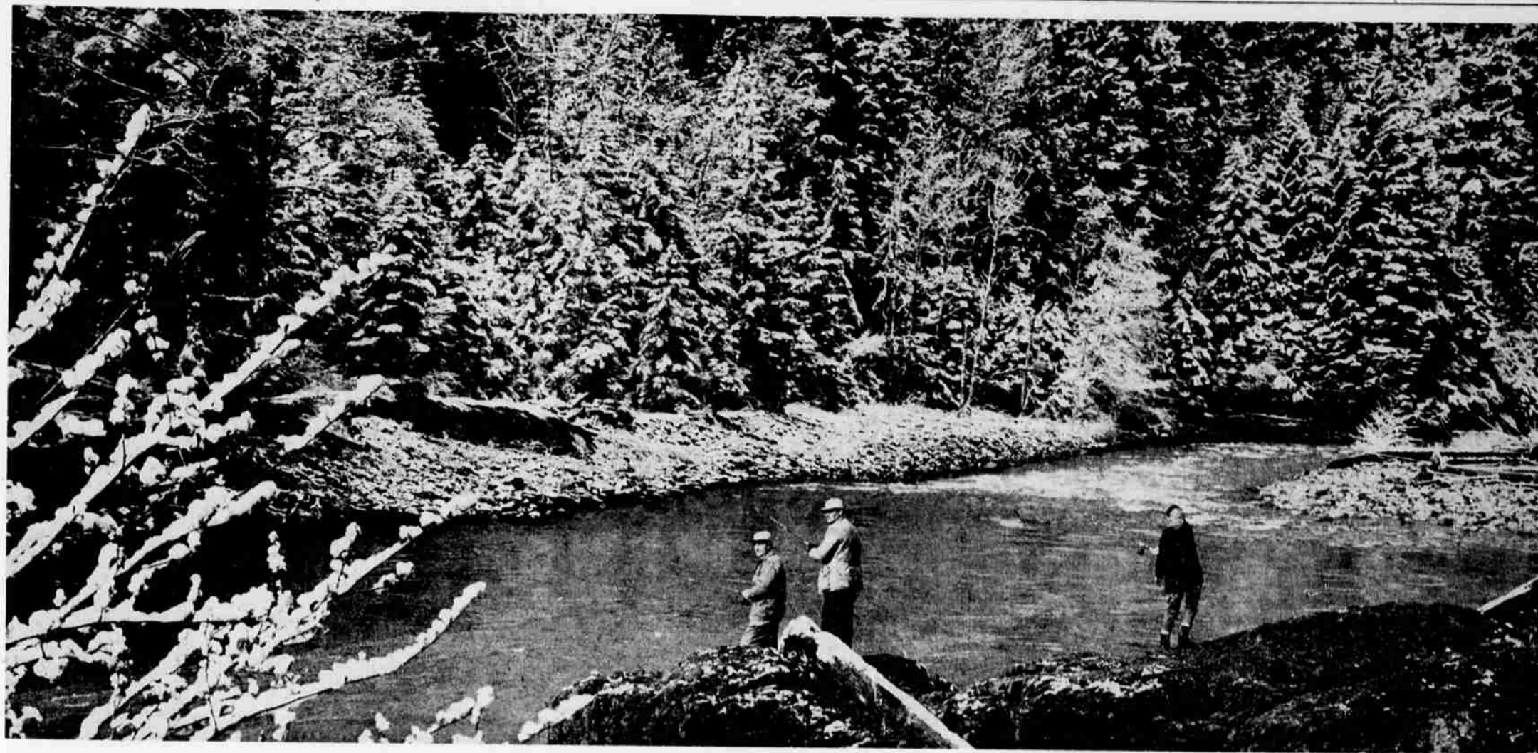
Anglers on Middle Fork of the Willamette Opened Trout Season Saturday Morning in a Wintery Setting (See Page 3B)