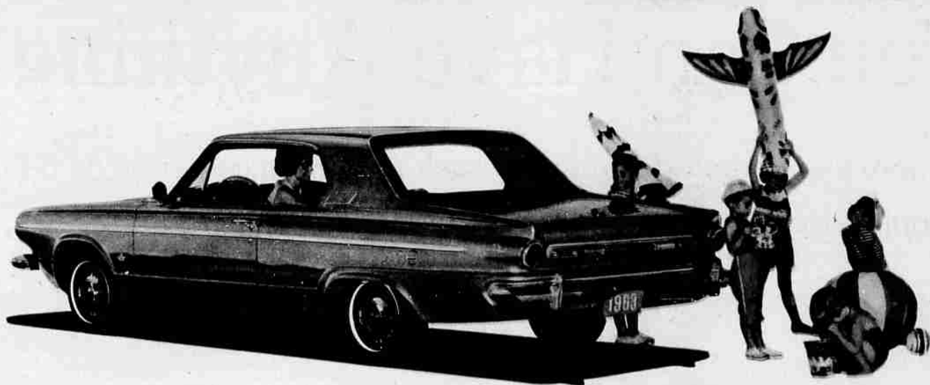
DODGE DART ALMOST EMPTY