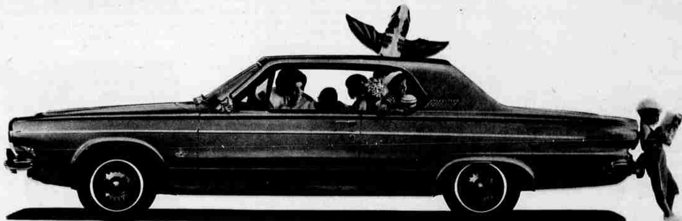
DODGE DART ALMOST FULL